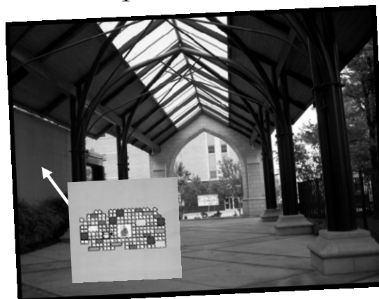
Example only. Actual layout will be approved by Trinity furnishings committee.

*Tile personalization and logo subject to approval by TEDS Board of Directors.